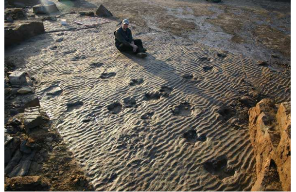
Muenchehagen Quarry near Hannover, Germany. 140 million year-old Iguanadontid and theropod dinosaur tracks on a shoreline.

Now put your thoughts into actions – and make your own dinosaur trail.